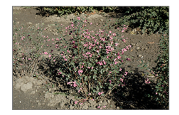
Sweet Sensation Snowberry

This shrub will require occasional maintenance and upkeep, and can be pruned at anytime. It is a good choice for attracting birds to your yard, but is not particularly attractive to deer who tend to leave it alone in favor of tastier treats. Gardeners should be aware of the following characteristic(s) that may warrant special consideration;