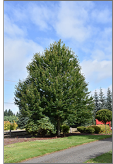
Redpointe Red Maple