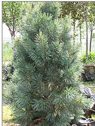
Vanderwolf's Pyramid Pine