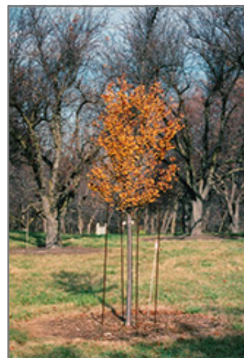
Lancelot Flowering Crab fruit