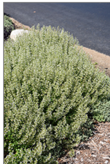
White Cloud Dwarf Calamint in bloom