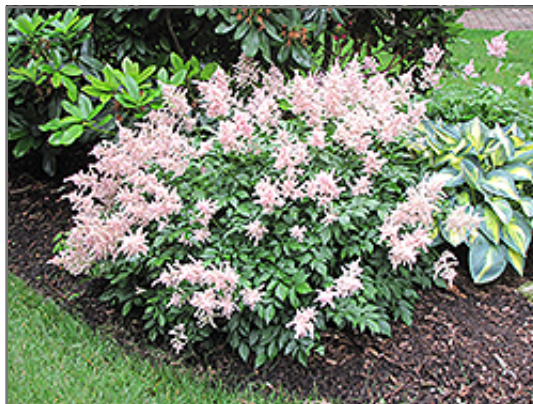
Peach Blossom Astilbe in bloom