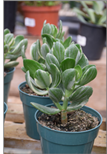
Variegated Jade Plant in full

This is a multi-stemmed evergreen houseplant with an upright spreading habit of growth. This plant can be pruned at any time to keep it looking its best.