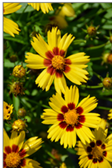
Sunkiss Tickseed flowers