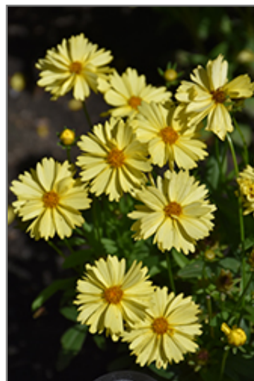
Leading Lady Lauren Tickseed flowers