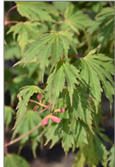
Northern Glow Maple foliage