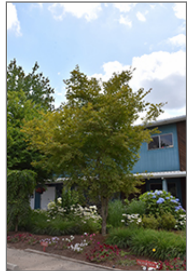
Northern Glow Maple

This tree does best in full sun to partial shade. It does best in average to evenly moist conditions, but will not tolerate standing water. It is not particular as to soil type or pH. It is somewhat tolerant of urban pollution. This particular variety is an interspecific hybrid.