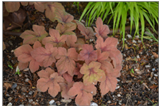
Pumpkin Spice Foamy Bells