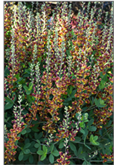
Decadence Cherries Jubilee False Indigo flowers

Have your garden come alive and buzzing with activity with these pollinator friendly plant options. Look for plants tagged with this promotion title: "Pollinator Friendly Plants" to add to your garden. You can also look for pollinator plants by scrolling to the bottom of each plant page and looking for the "butterfly" symbol. Click "Learn more about this promotion!" for more inspiration from one of our vendors, Monrovia.