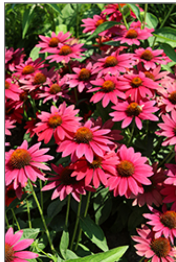
Sombrero Tres Amigos Coneflower flowers

This is a relatively low maintenance plant, and is best cleaned up in early spring before it resumes active growth for the season. It is a good choice for attracting butterflies to your yard, but is not particularly attractive to deer who tend to leave it alone in favor of tastier treats. It has no significant negative characteristics.