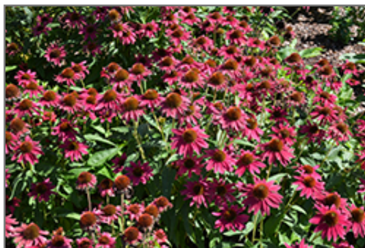
Sombrero Tres Amigos Coneflower in bloom