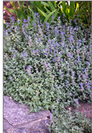
Early Bird Catmint in bloom