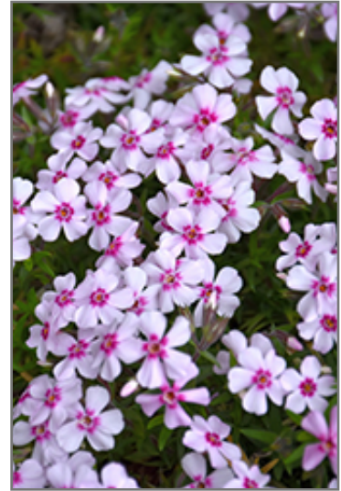
Coral Eye Moss Phlox flowers

Coral Eye Moss Phlox will grow to be only 4 inches tall at maturity, with a spread of 18 inches. When grown in masses or used as a bedding plant, individual plants should be spaced approximately 14 inches apart. Its foliage tends to remain low and dense right to the ground. It grows at a medium rate, and under ideal conditions can be expected to live for approximately 10 years. As an evergreen perennial, this plant will typically keep its form and foliage year-round.