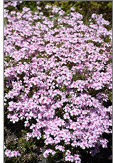
Coral Eye Moss Phlox flowers