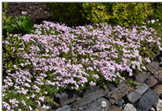
Coral Eye Moss Phlox in bloom