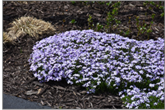
Spring Blue Moss Phlox in bloom