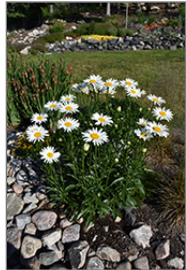
Becky Shasta Daisy in bloom

Have your garden come alive and buzzing with activity with these pollinator friendly plant options. Look for plants tagged with this promotion title: "Pollinator Friendly Plants" to add to your garden. You can also look for pollinator plants by scrolling to the bottom of each plant page and looking for the "butterfly" symbol. Click "Learn more about this promotion!" for some more inspiration and articles from one of our growers, Monrovia!