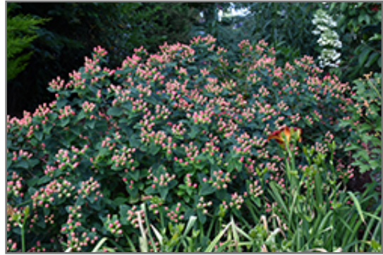
FloralBerry Rosé St. John's Wort fruit

FloralBerry Rosé St. John's Wort will grow to be about 3 feet tall at maturity, with a spread of 3 feet. It tends to fill out right to the ground and therefore doesn't necessarily require facer plants in front. It grows at a medium rate, and under ideal conditions can be expected to live for approximately 5 years. This is a self-pollinating variety, so it doesn't require a second plant nearby to set fruit.