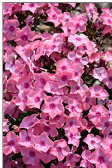
Sweet Summer Queen Garden Phlox flowers