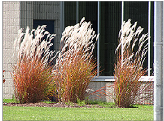
Purple Flame Grass in bloom