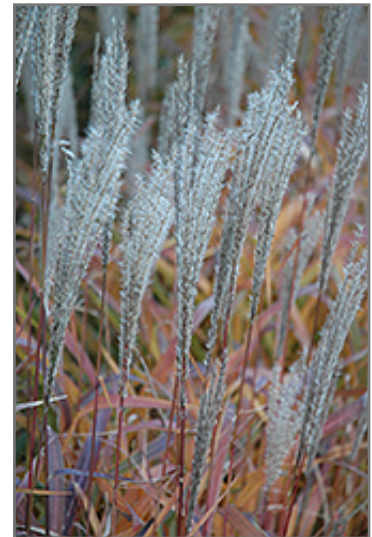
Purple Flame Grass fruit