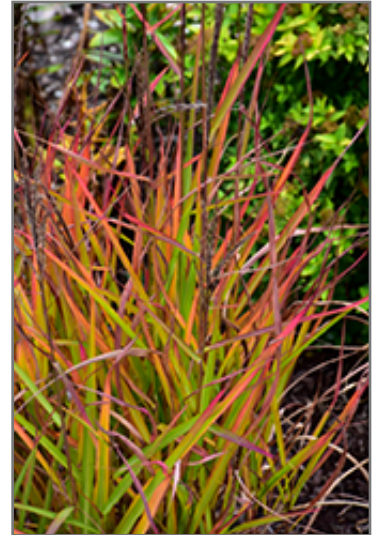
Purple Flame Grass in fall

This plant does best in full sun to partial shade. It prefers to grow in average to moist conditions, and shouldn't be allowed to dry out. It is not particular as to soil type or pH. It is highly tolerant of urban pollution and will even thrive in inner city environments. This is a selected variety of a species not originally from North America. It can be propagated by division; however, as a cultivated variety, be aware that it may be subject to certain restrictions or prohibitions on propagation.