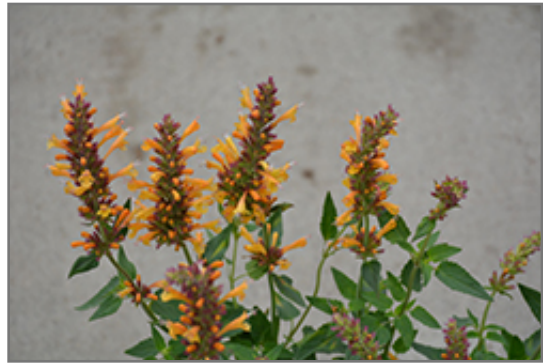
Kudos Gold Hyssop flowers