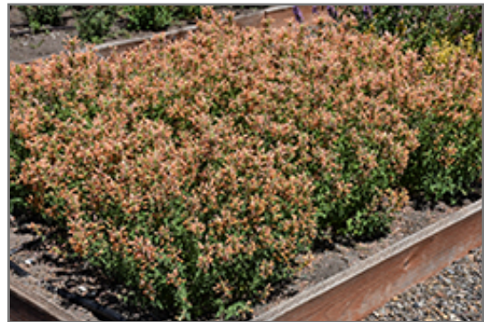
Kudos Gold Hyssop in bloom