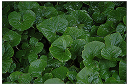
Canadian Wild Ginger