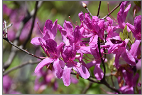
Lilac Lights Azalea flowers