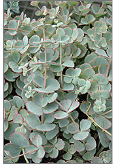
October Daphne

October Daphne is a fine choice for the garden, but it is also a good selection for planting in outdoor pots and containers. It is often used as a 'filler' in the 'spiller-thriller-filler' container combination, providing a mass of flowers and foliage against which the thriller plants stand out. Note that when growing plants in outdoor containers and baskets, they may require more frequent waterings than they would in the yard or garden.