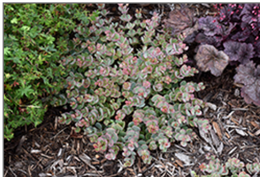
October Daphne