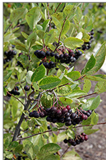
Iroquois Beauty Black Chokeberry fruit