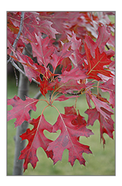
Northern Pin Oak in fall