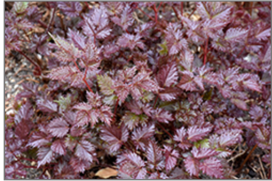
Delft Lace Astilbe foliage

Delft Lace Astilbe will grow to be about 16 inches tall at maturity extending to 24 inches tall with the flowers, with a spread of 12 inches. When grown in masses or used as a bedding plant, individual plants should be spaced approximately 12 inches apart. Its foliage tends to remain dense right to the ground, not requiring facer plants in front. It grows at a medium rate, and under ideal conditions can be expected to live for approximately 10 years. As an herbaceous perennial, this plant will usually die back to the crown each winter, and will regrow from the base each spring. Be careful not to disturb the crown in late winter when it may not be readily seen!