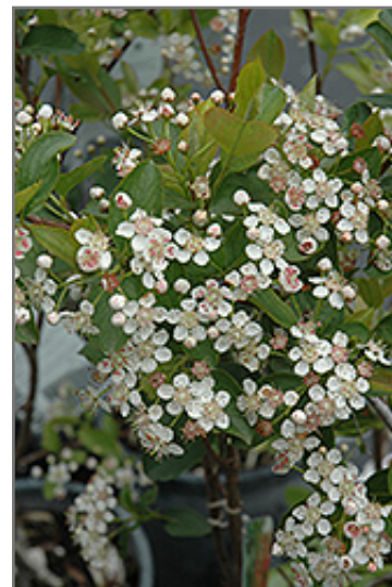
Viking Chokeberry flowers