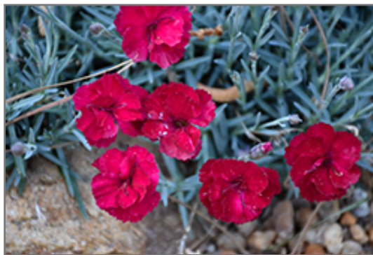
Frosty Fire Pinks flowers