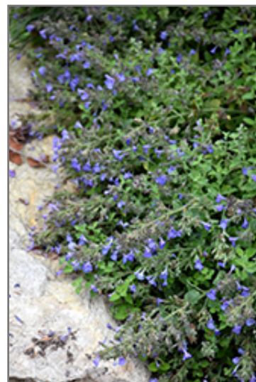
Kit Kat Catmint in bloom

Kit Kat Catmint is recommended for the following landscape applications;