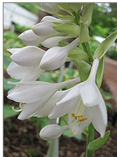
Rosedale Golden Goose Hosta flowers