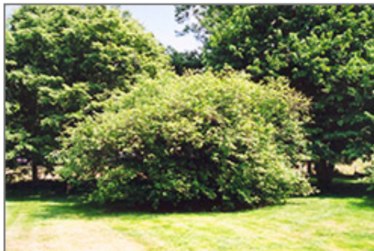
American Hazelnut

American Hazelnut will grow to be about 12 feet tall at maturity, with a spread of 8 feet. It tends to be a little leggy, with a typical clearance of 2 feet from the ground, and is suitable for planting under power lines. It grows at a medium rate, and under ideal conditions can be expected to live for approximately 30 years. While it is considered to be somewhat self-pollinating, it tends to set heavier quantities of fruit with a different variety of the same species growing nearby.