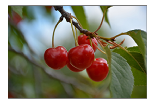
Montmorency Cherry fruit