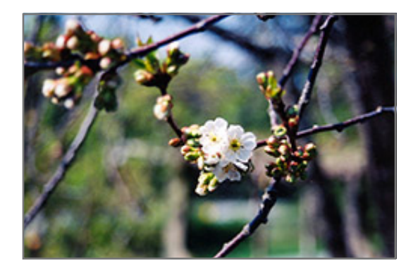
Montmorency Cherry flowers

This is a deciduous tree with a shapely oval form. Its average texture blends into the landscape, but can be balanced by one or two finer or coarser trees or shrubs for an effective composition. This plant will require occasional maintenance and upkeep, and is best pruned in late winter once the threat of extreme cold has passed. It is a good choice for attracting birds and bees to your yard. It has no significant negative characteristics.