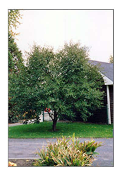
Montmorency Cherry