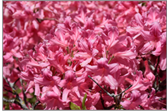
Rosy Lights Azalea flowers

Rosy Lights Azalea is recommended for the following landscape applications;