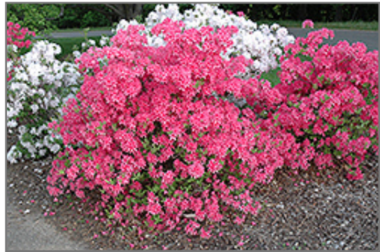
Rosy Lights Azalea in bloom