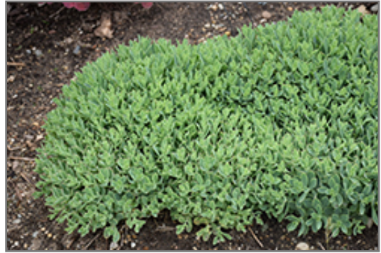
Rock 'N Round Pure Joy Stonecrop

Rock 'N Round Pure Joy Stonecrop will grow to be about 10 inches tall at maturity, with a spread of 15 inches. When grown in masses or used as a bedding plant, individual plants should be spaced approximately 12 inches apart. Its foliage tends to remain low and dense right to the ground. It grows at a fast rate, and under ideal conditions can be expected to live for approximately 15 years. As an herbaceous perennial, this plant will usually die back to the crown each winter, and will regrow from the base each spring. Be careful not to disturb the crown in late winter when it may not be readily seen!