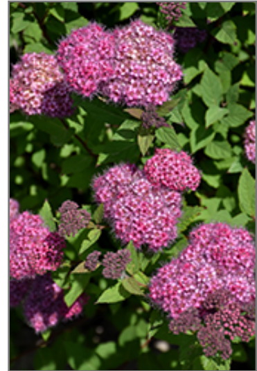
Double Play Artisan Spirea flowers

Double Play Artisan Spirea is recommended for the following landscape applications;