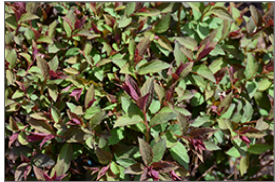
Double Play Artisan Spirea foliage