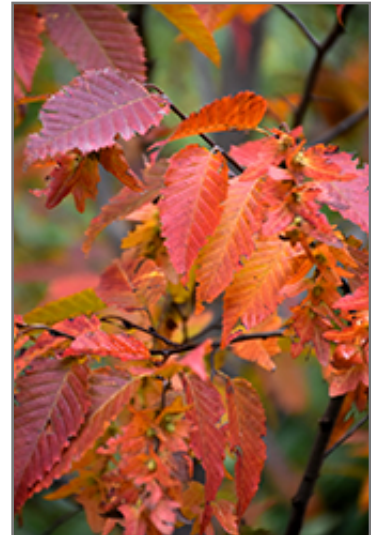
Firespire American Hornbeam in fall