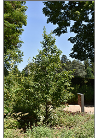
Firespire American Hornbeam

This tree performs well in both full sun and full shade. It is an amazingly adaptable plant, tolerating both dry conditions and even some standing water. It is not particular as to soil type or pH. It is somewhat tolerant of urban pollution. This is a selection of a native North American species.