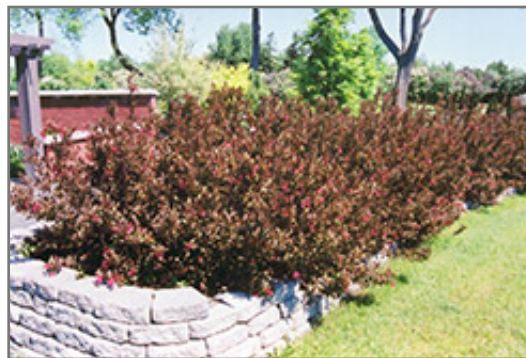
Wine and Roses Weigela