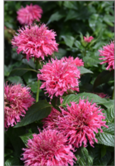
Sugar Buzz Bubblegum Blast Beebalm flowers