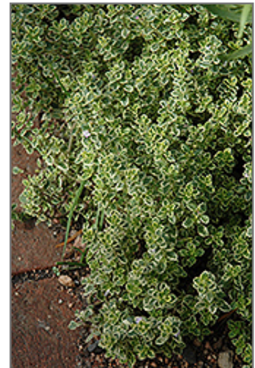
Aureus Lemon Thyme foliage