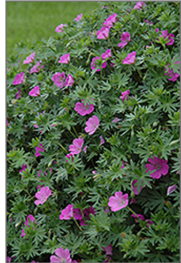
Bloody Cranesbill flowers