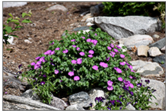
Bloody Cranesbill in bloom