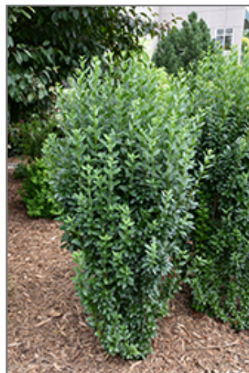
Straight Talk Privet