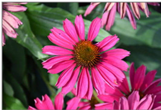
Kismet Raspberry Coneflower flowers