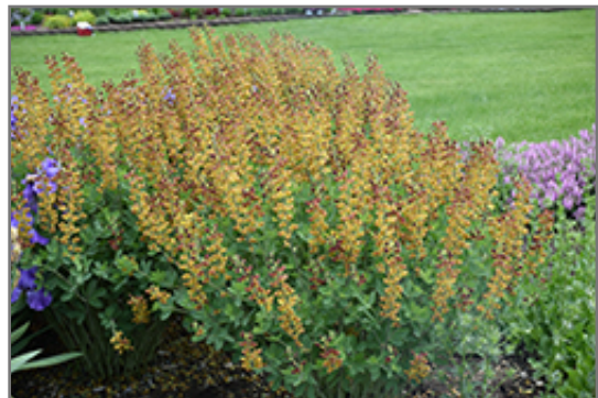
Decadence Cherries Jubilee False Indigo in bloom