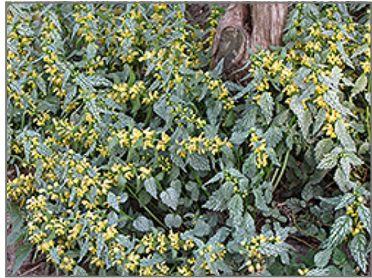
Hermann's Pride Yellow Archangel in bloom

This plant does best in partial shade to shade. It is an amazingly adaptable plant, tolerating both dry conditions and even some standing water. It is considered to be drought-tolerant, and thus makes an ideal choice for a low-water garden or xeriscape application. It is not particular as to soil type or pH. It is highly tolerant of urban pollution and will even thrive in inner city environments. This is a selected variety of a species not originally from North America. It can be propagated by division; however, as a cultivated variety, be aware that it may be subject to certain restrictions or prohibitions on propagation.