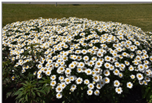
Becky Shasta Daisy in bloom