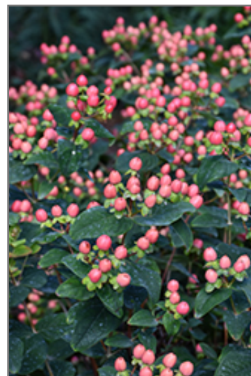
FloralBerry Rosé St. John's Wort fruit

FloralBerry Rosé St. John's Wort is recommended for the following landscape applications;