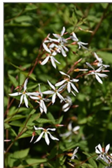
Bowman's Root flowers

This plant will require occasional maintenance and upkeep, and should be cut back in late fall in preparation for winter. It is a good choice for attracting bees and butterflies to your yard. It has no significant negative characteristics.