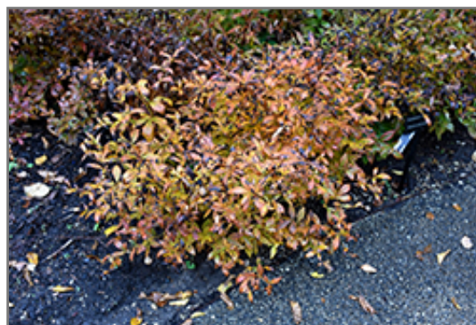
Bowman's Root in fall