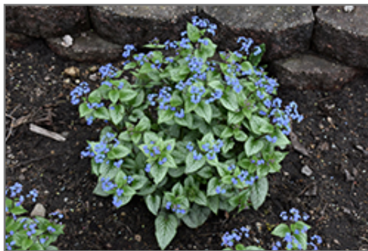
Sterling Silver Bugloss in bloom