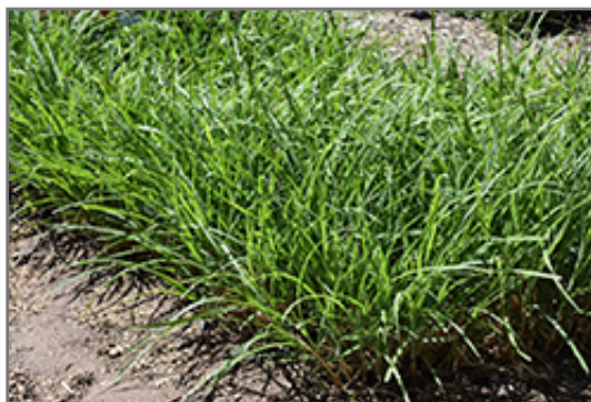
Mystal Tiger Tail Maiden Grass

Mystal Tiger Tail Maiden Grass is recommended for the following landscape applications;